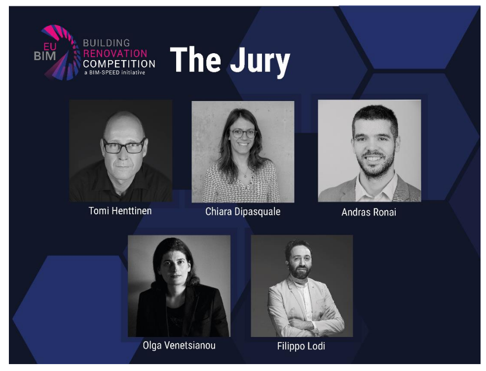
Figure 4 - The competition Jury Members

any questions they might've had. Following this the jury members were continuously involved in decisions about the implementation of the competition, such as the multiple extensions of the deadlines and the promotion efforts. Due to a late submission, the evaluation period from the Jury took place from July to August 2022, who received the submissions anonymized.