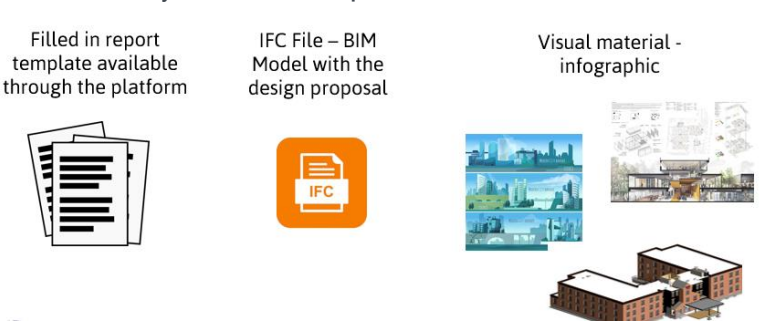
Figure 3 - Deliverables that participants had to submit for the competition

The deliverables had to be uploaded onto the platform and once finished, access to the organisers had to be granted to the workspace on the platform by the participants (to Jasper Vermaut from REHVA and Roberta Stankeviciute from FIEC). In turn, the organisers uploaded the deliverables onto an anonymised Google Drive folder for the Jury's evaluation.